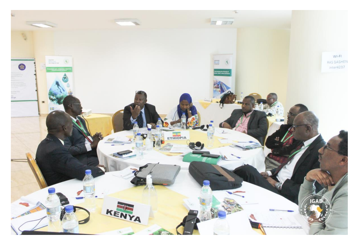
National planning experts from IGAD MSs trained on mainstreaming BE in the development plans

IGAD Blue Economy PMU organized a training in Addis Ababa from 28 Nov - 01 December 2022 on Blue Economy Coordination Mechanisms and mainstreaming Blue Economy in the national development plans of the IGAD Member States. In this training one planning expert from the national planning offices of each IGAD MS have actively participated. In this training in addition to the planning experts, all NFPs and consultants recruited to develop national BE strategy have also participated. Please refer the objectives and outputs achieved during the training under section Activity 1.1.4 above.