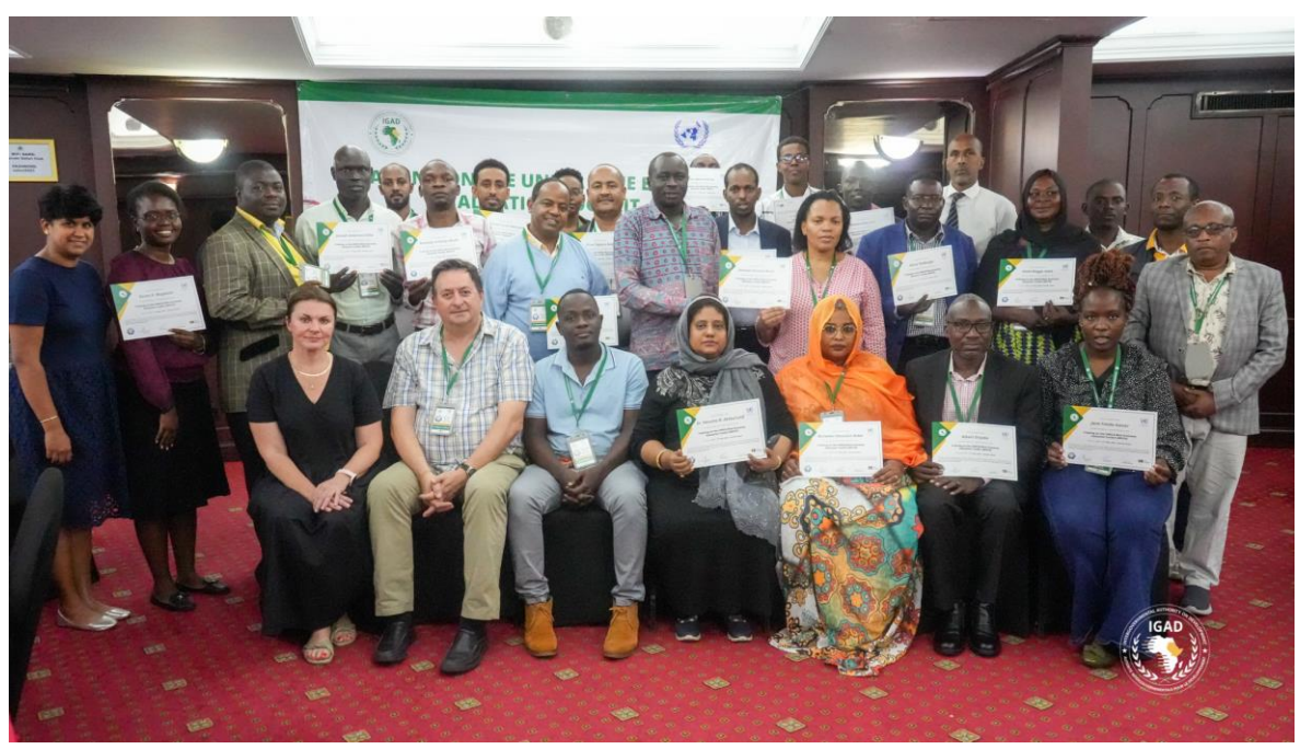
A Photo taken during the conclusion of the BEVTK training in Nairobi, Kenya on 17<sup>th</sup> May 2023

This trained was aimed at equipping policy makers and relevant stakeholders with skills that would enable them to conduct adequate planning (strategic and resources) in order to optimise on the Blue Economy potential available to them. The outcomes achieved from the training are: