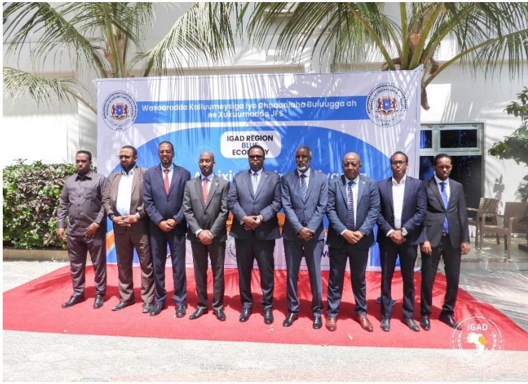
BE strategy validation in Mogadishu, Somalia

The validation workshops were led by the Ministries responsible for coordinating Blue Economy. The invitation for the participants were sent out by the focal Ministries. IGAD covered the financial and technical components through the Sweden Government financed project.