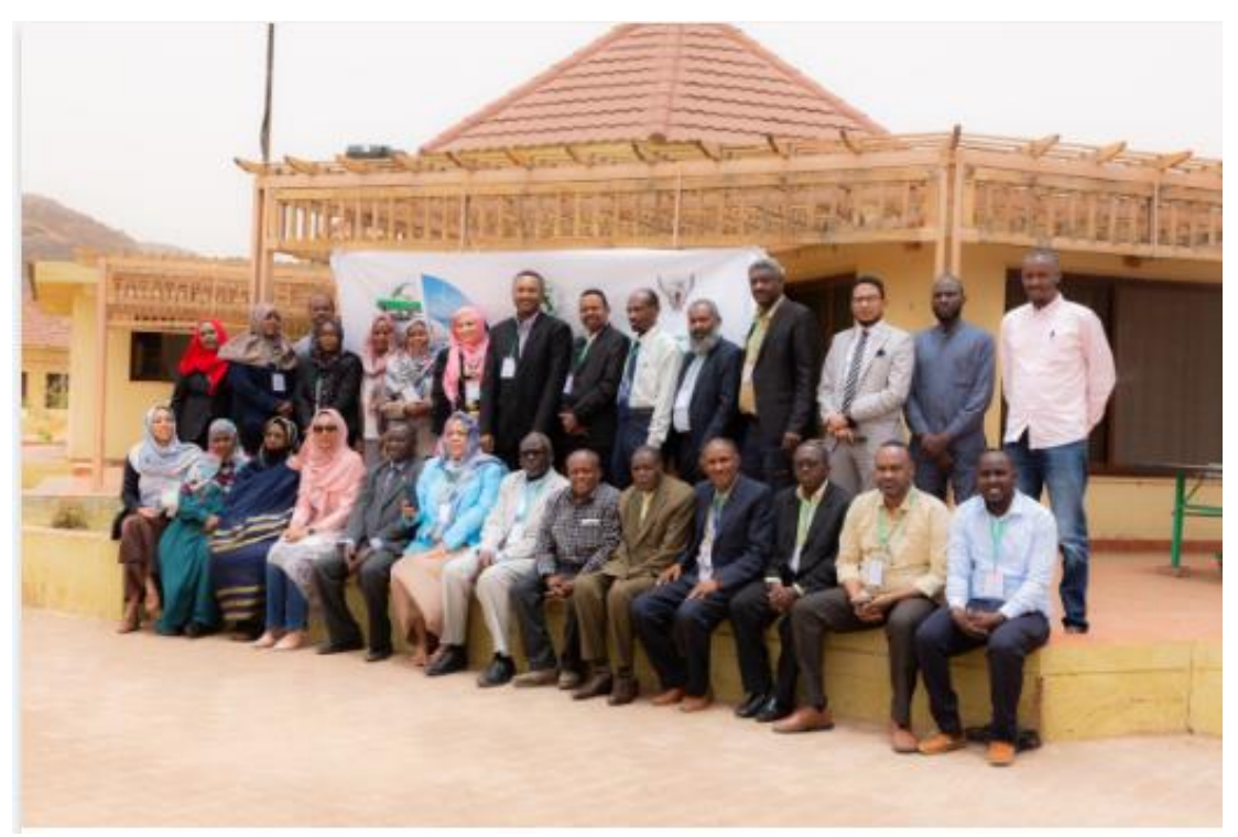
BE Baseline Report Validation Workshop for Sudan, Al Sabalouga, River Nile State (July 4 – 6, 2022)

During the previous reporting period, the validation of BE baseline studies by all the 7 IGAD MSs, except Sudan, was incorporated. All validation workshops of the national BE baseline reports were planned to be validated in Year 1 of the project period but for Sudan it was not possible due to various issues. IGAD facilitated a validation workshop from July 4 - 6, 2022 in Al Sabalouga (River Nile State) for Sudan for the BE baseline study report. The national report was presented for validation and endorsement, while filling in possible gaps. The purpose of the validation workshop was also to create a national BE platform to serve as a technical group to support the preparation of national BE Strategy.