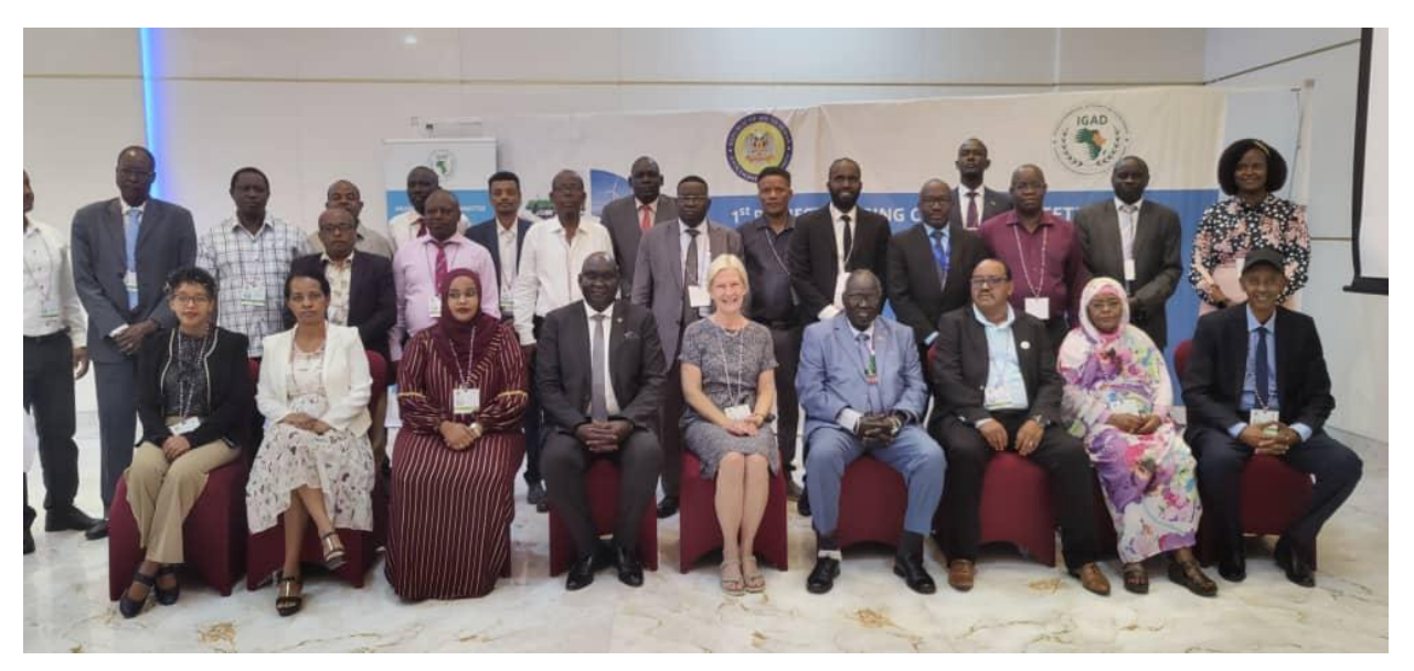
Photo taken during the 1<sup>st</sup> Steering Committee meeting held in Juba, South Sudan on 7-9 November 2022