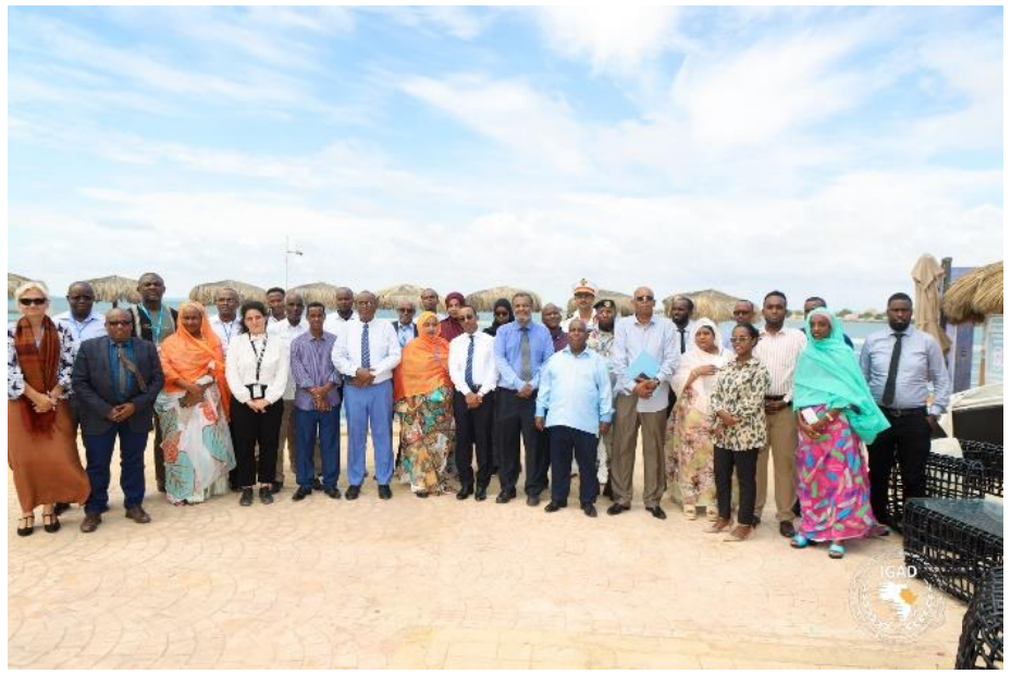
BE strategy validation in Djibouti

During this quarter, the project supported Djibouti to develop and validate its National Blue Economy Strategy (2023-2027). The project supported the organization of the Validation of Djibouti Blue Economy Strategy from 23 to 25 May 2023 under the auspice of the Ministry of Environment and Sustainable Development of Djibouti, which the focal ministry in charge of BE for Djibouti. The technical discussions of the strategy took place in Arta, at Sunny Hill Centre on 23 and 24 May.