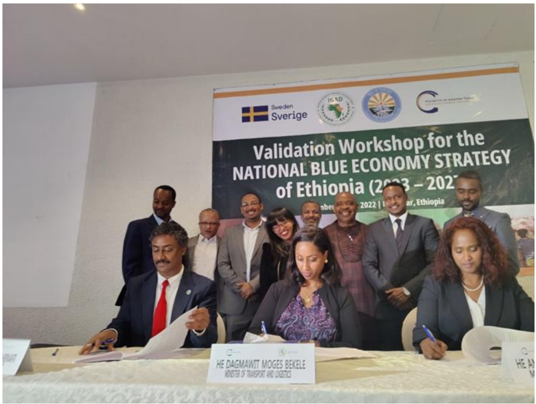
Ministers appending signatures to a joint communique following the adoption of the Ethiopia National Blue Economy Strategy