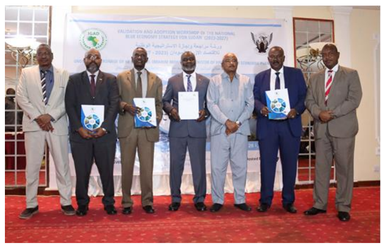
BE strategy validation in Juba, South Sudan

From 26-28 February 2023, the Ministry of Finance & Economic Planning, which is the BE Focal Ministry, with the support of IGAD, organized a three-day validation and adoption workshop of the National Blue Economy Strategy at Coral Hotel in Port Sudan. The first two days involved a review by technical officers from the BE thematic sectors of Irrigation and Water Resources; Agriculture and Forests; Petroleum and Mining; Transportation, Bridges and Roads; and Animal Resources to finalize the strategy and prepare a report and a declaration. The third day was dedicated to the Ministers of Finance and Economic Planning; Irrigation and Water Resources; Petroleum and Mining; Transportation, Bridges and Forests; Petroleum and Blue Economic Planning; Irrigation and Water Resources; Agriculture and Forests; Petroleum and Mining; Transportation, Bridges and Roads; and Animal Resources to finalize the strategy for Sudan.